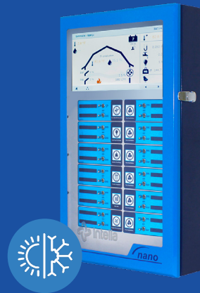
NANO+ TOTAL CONTROL

Intelio has a controller for every livestock operation. The line goes from the unique Solo light dimmer to multitasking Unity and sophisticated Internet-connected Nano. Intelio's controllers give you total control of your production environment.