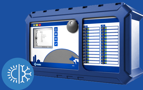
UNITY CLIMATE CONTROL