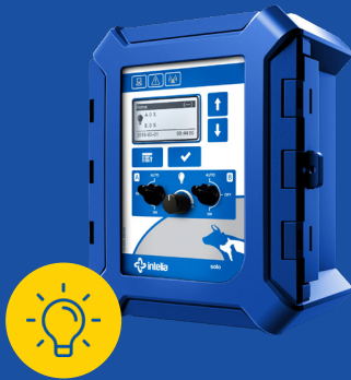
SOLO PROGRAMMABLE LIGHTING CONTROL